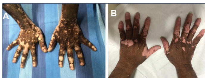
[Table/Fig-2]: Depigmented vitiligo patches on the dorsum of the hand.